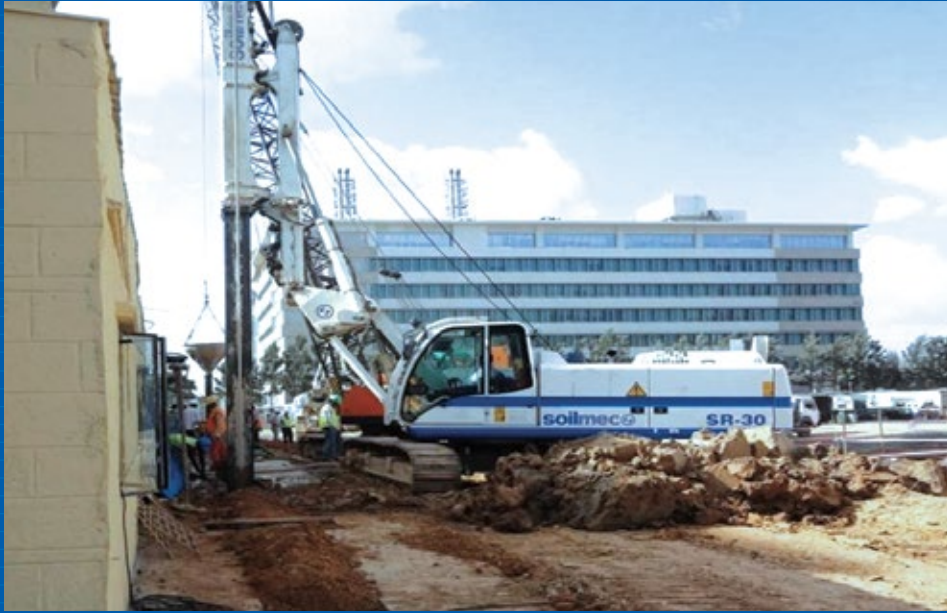
Diaphragm Wall -Bangalore