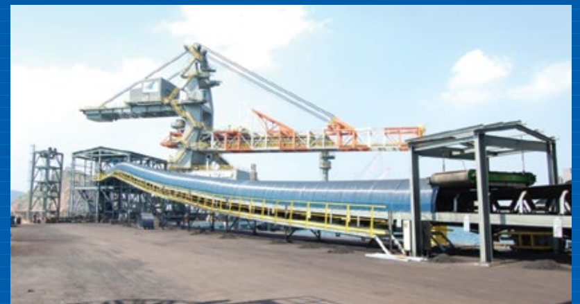
Gangavaram Port Speciality Precast Girder