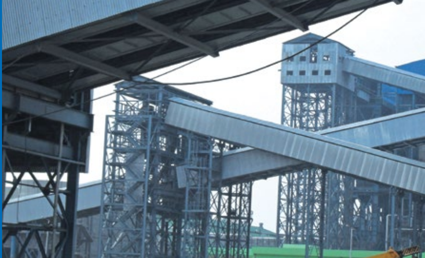
BORI Material Handling System For Power Plant - BINA, Madhya Pradesh