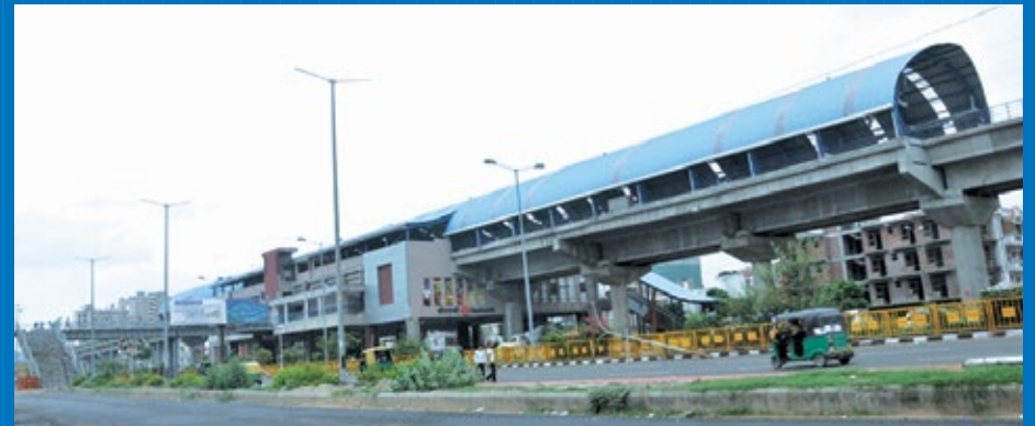
Kaushambhi Metro Station -Noida, Uttar Pradesh