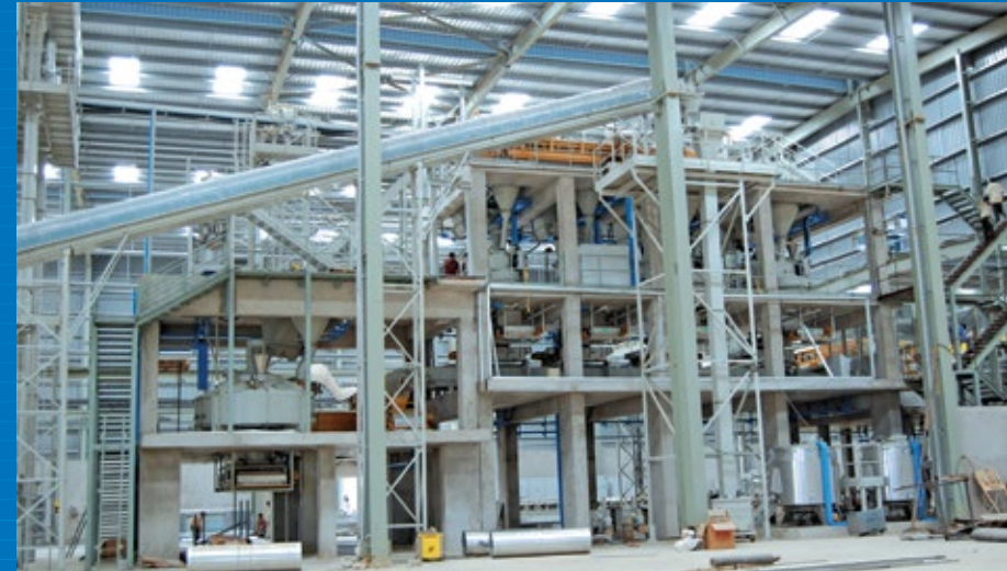
Pokarna - Visakhapatnam

From designing and building of power plants and industrial buildings to material handling system and electrical works, the company relies on its profound experience, time-tested methods, and most-modern technology to execute mission-critical projects in challenging environments.