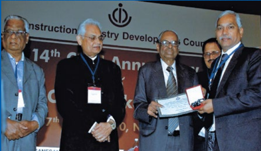
Our CMD receiving Vishwakarma Award from Chairman of the Prime Minister's Economic Advisory Council, Dr. C. Rangarajan.