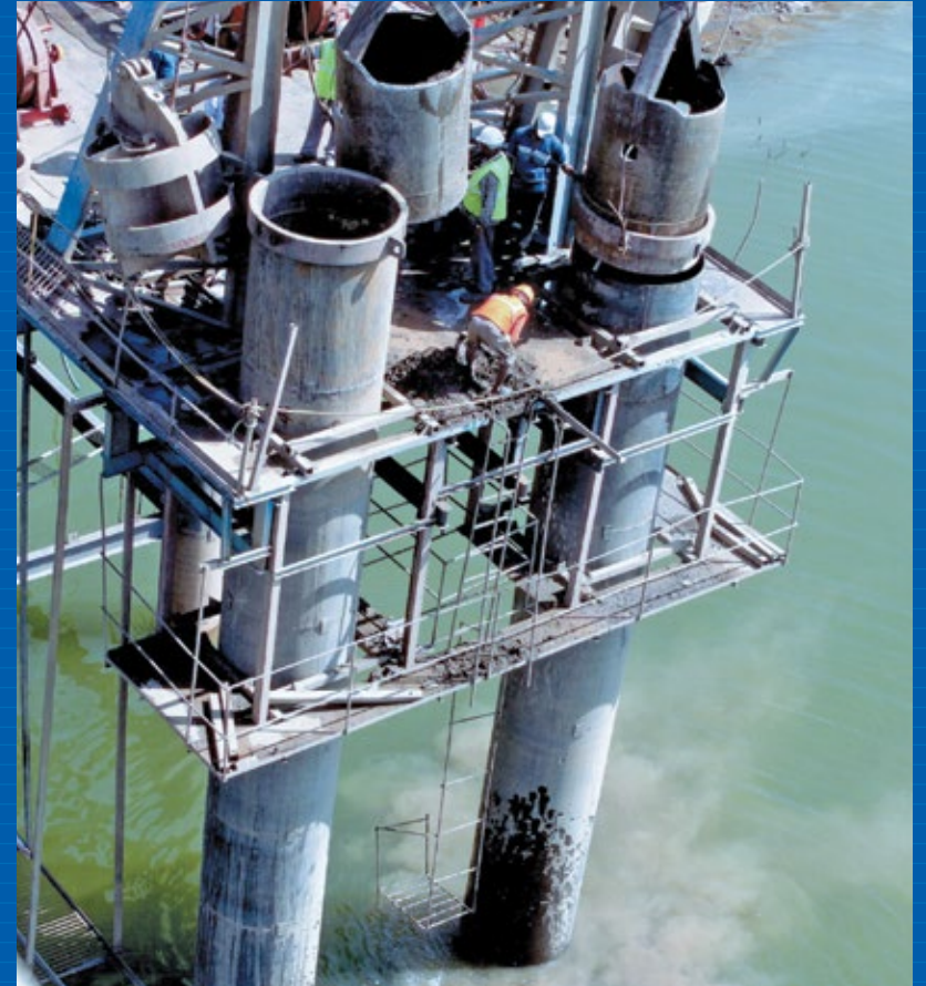
Site Gantry -Dhule