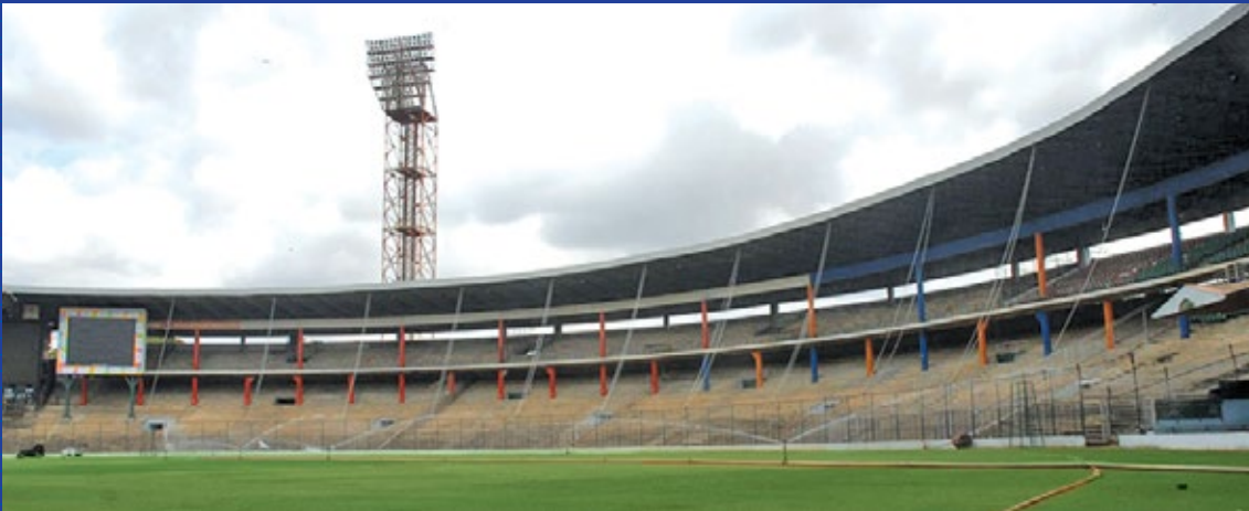
KSDA stadium -Bengaluru

With portfolio of super luxury hotels & resorts, ultra modern residential enclaves, stadiums, high end commercial complexes and hospitals, VNC is capable of delivering complex projects from concept o completion and making landmarks in their own right