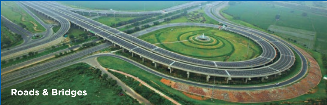
Roads & Bridges