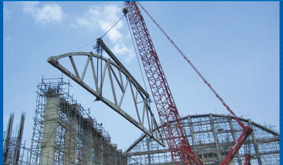
Coromandel International -Kakinada, Andhra Pradesh