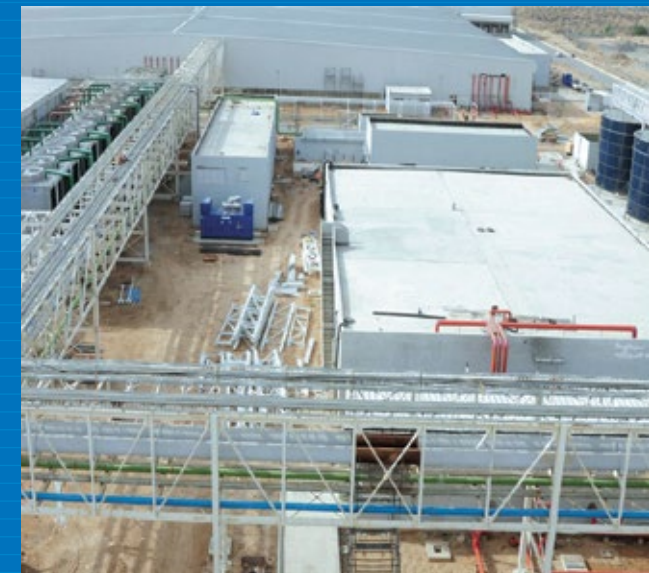
Ford Factory - Ahmedabad