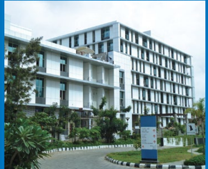
ESCI Medical College & Hospital -Hyderabad