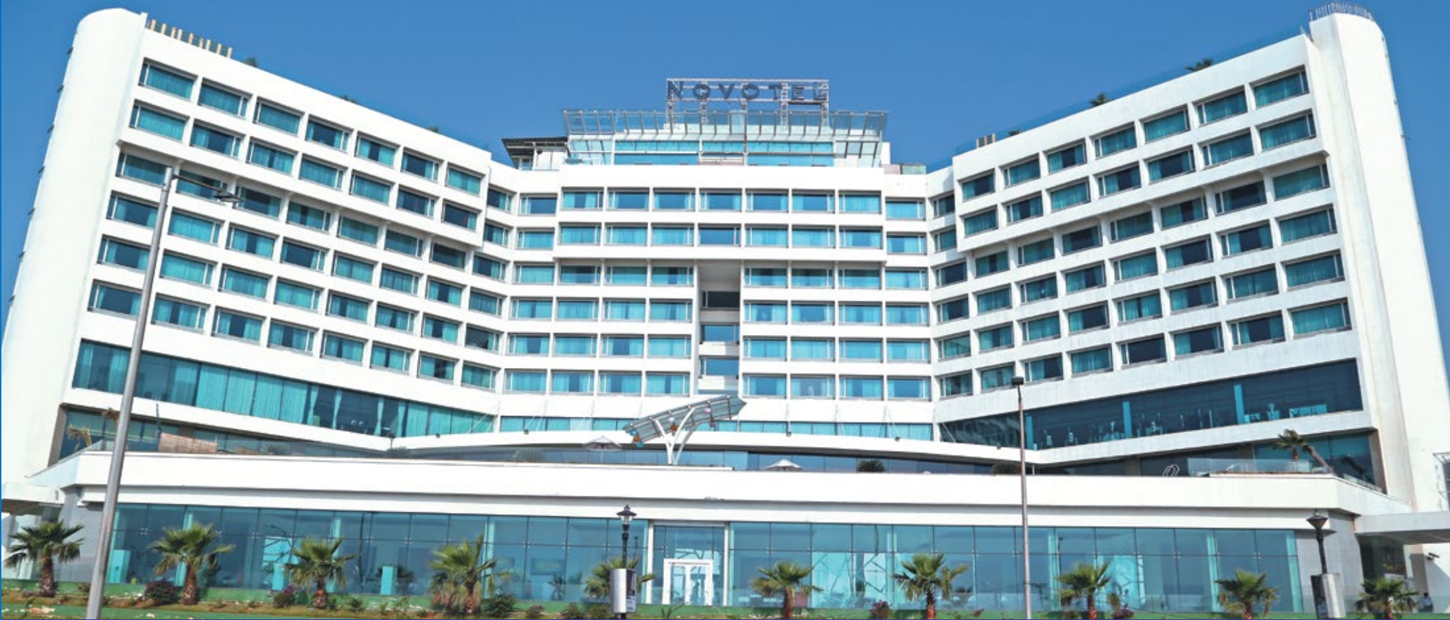
Novotel Hotel & Multiplex Complex -Visakhapatnam