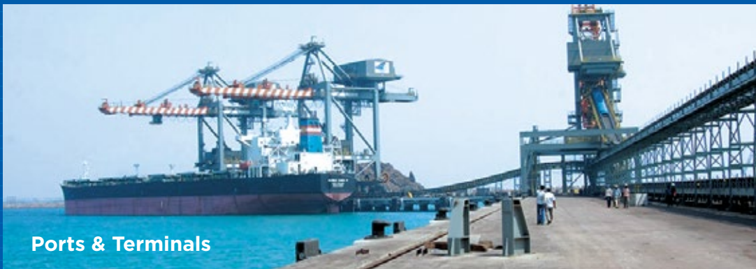
Ports & Terminals