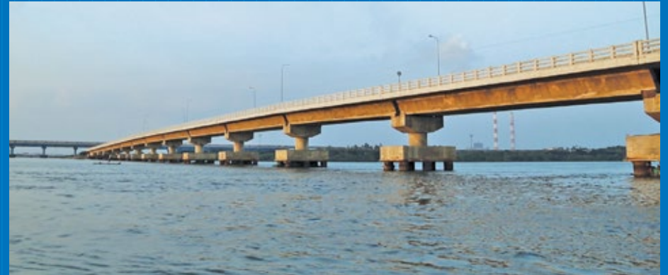
Tapi Bridge -Maharashtra