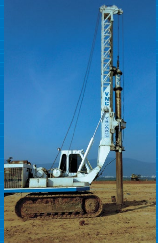
HPCL Piling Work -Visakhapatnam