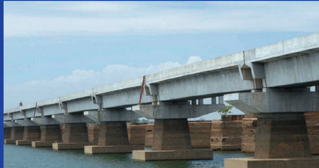
Lakshmanatheertha Bridge -Mysore