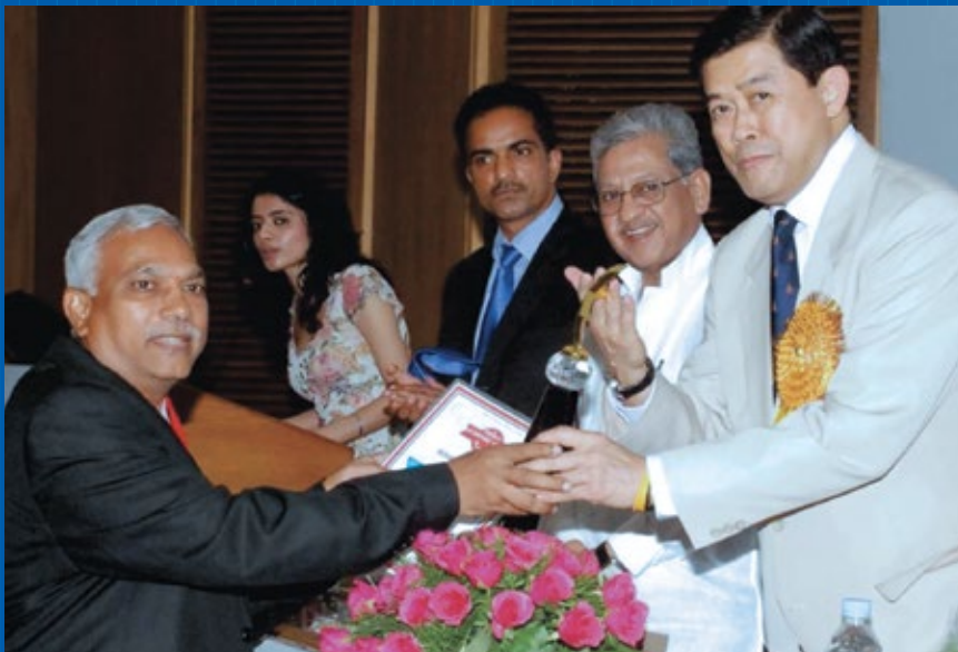
Indian Achievers Award for Business Excellence on the occasion of 29th India International Achievers on INDO-THAI business relations.