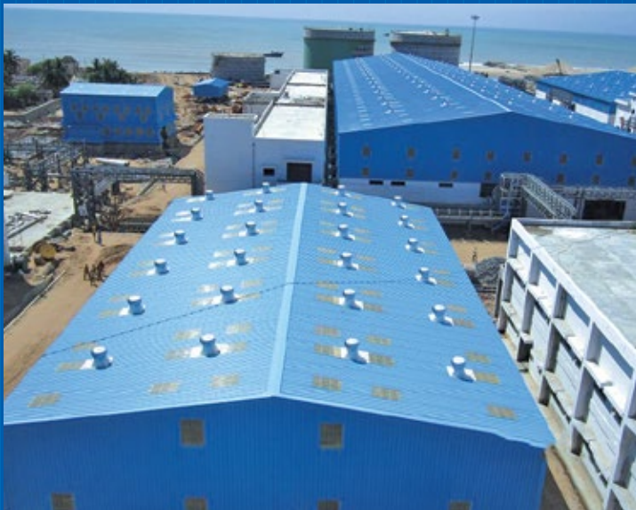
Va Tech Wabag - Nemmeli, Chennai