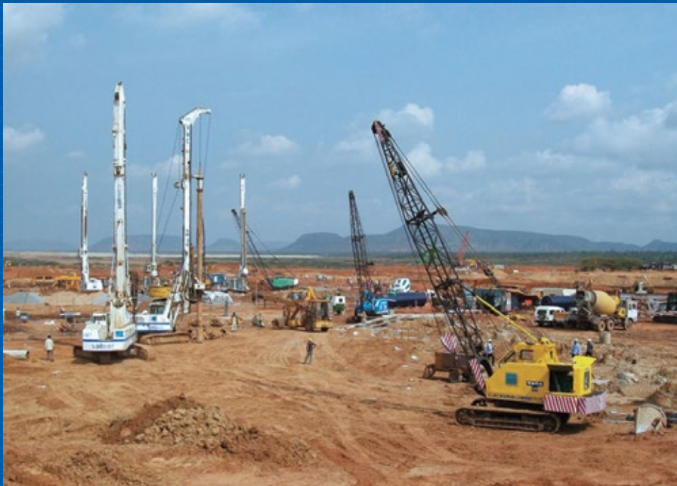
Piling Work at EQ-9 Berth -Visakhapatnam