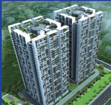
Lansum Oxygen Towers -Visakhapatnam