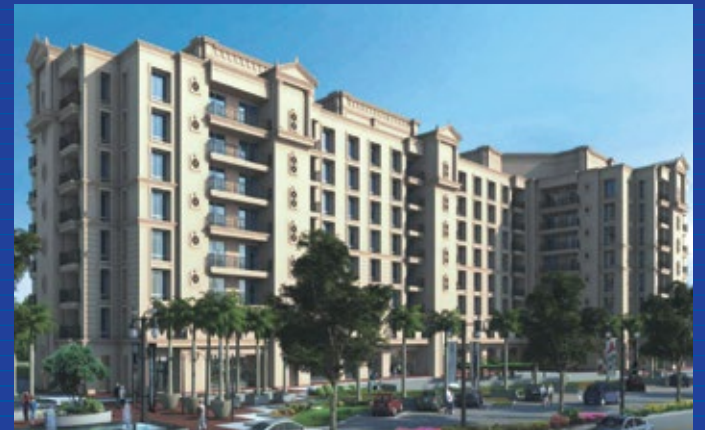
Hiranandani Calgery Apartments -Bengaluru