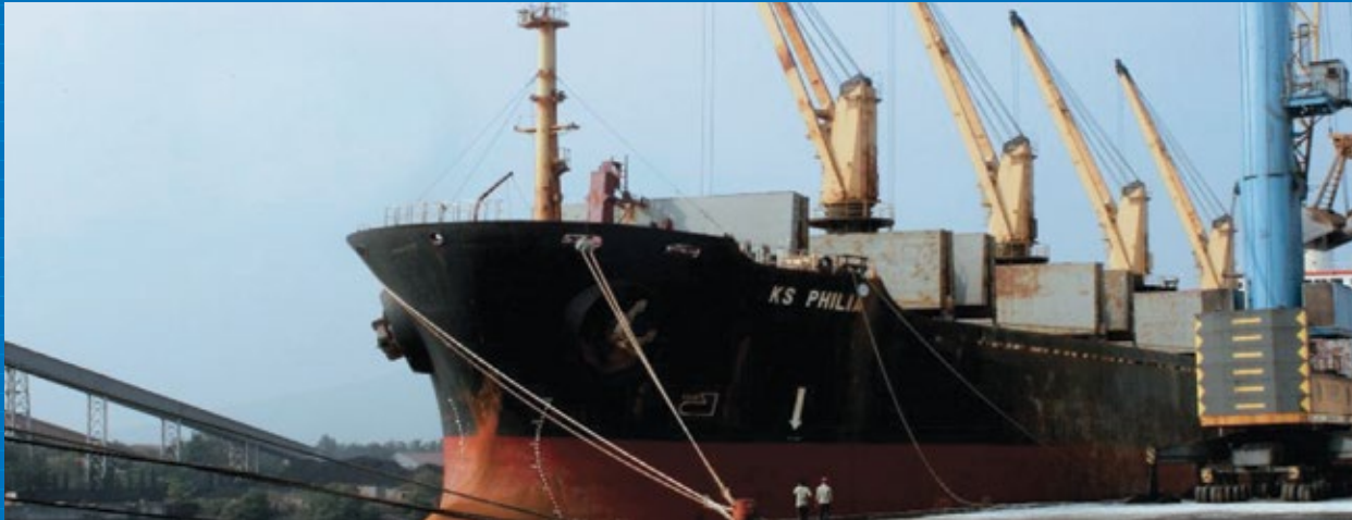
Gangavaram Port -Visakhapatnam

Specialising in ballast less track for metros, piling works, marine structures and diaphragm walls, the company is ready to solve any challenge with a wide spectrum of specialised services, on time and within budget.