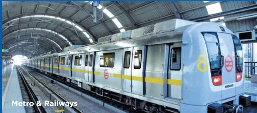
Metro & Railways