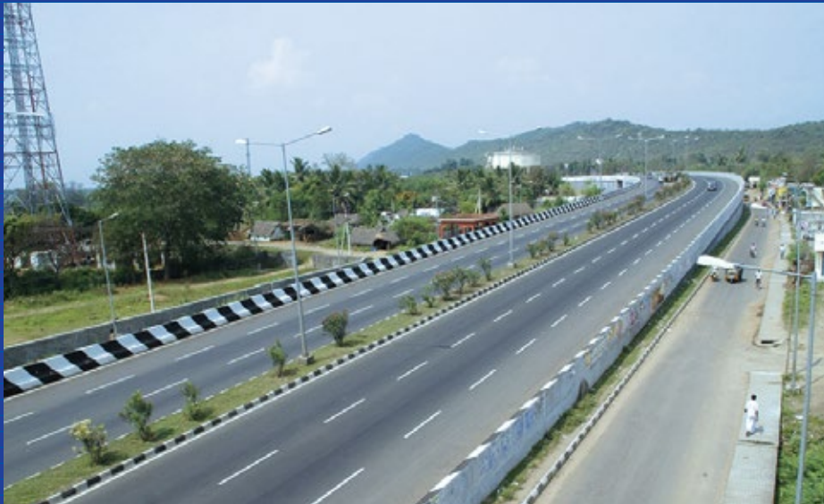
Tambaram- Tinidvanam Road Project -Tamil Nadu