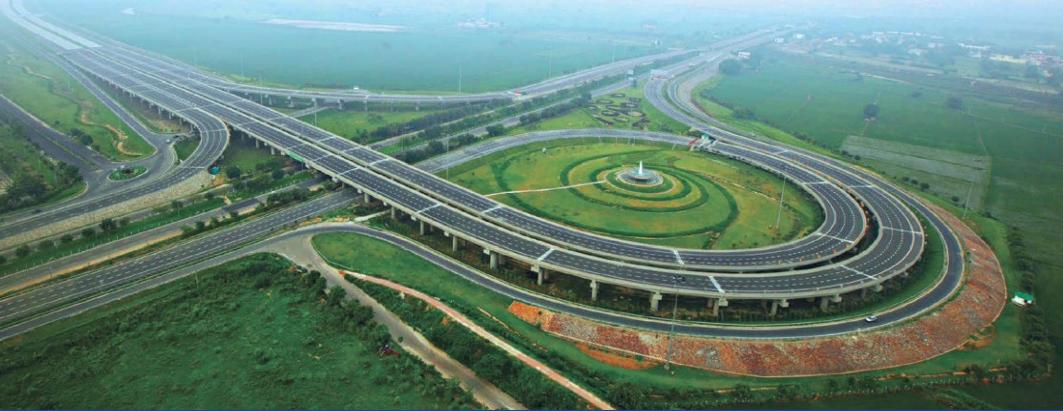
Yemuna Express Way -Greater Noida, Uttar Pradesh