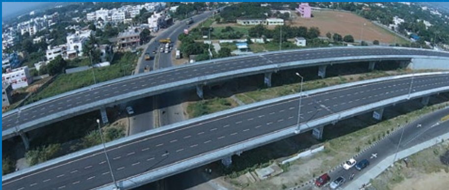
Outer Ring Road -Chennai